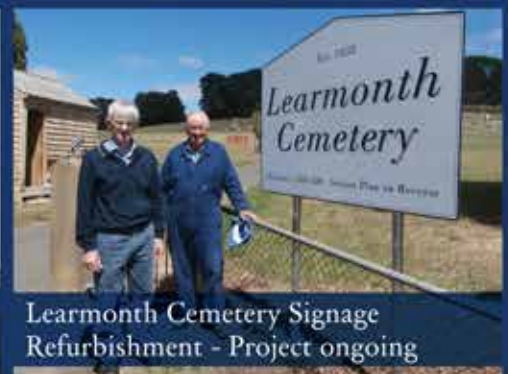
Learmonth Cemetery Signage Refurbishment - Project ongoing