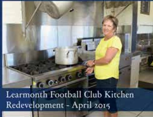
Learmonth Football Club Kitchen Redevelopment - April 2015