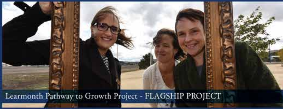
Learmonth Pathway to Growth Project - FLAGSHIP PROJECT