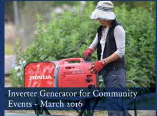
Inverter Generator for Community Events - March 2016

The City of Ballarat is proud to partner with the remarkable and dedicated people of Learmonth to deliver 11 great community projects and complete the Engaging Communities Program.