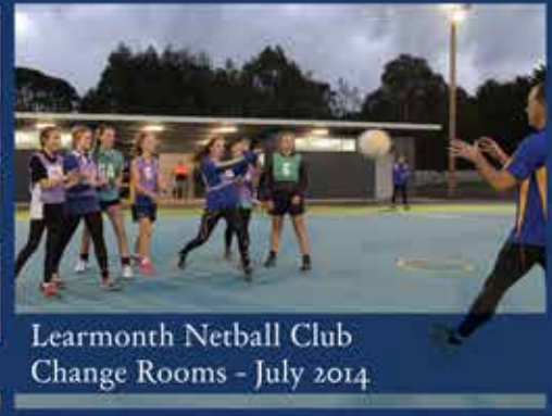
Learmonth Netball Club Change Rooms - July 2014