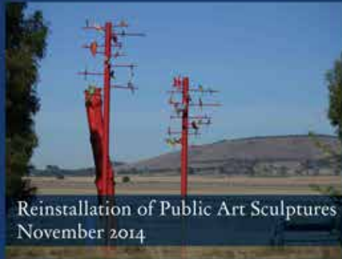
Reinstallation of Public Art Sculptures November 2014