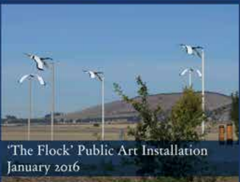
'The Flock' Public Art Installation January 2016