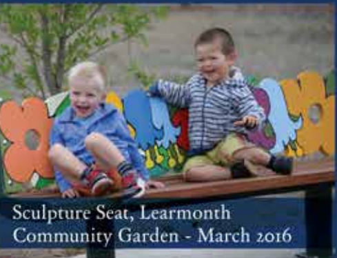
Sculpture Seat, Learmonth Community Garden - March 2016