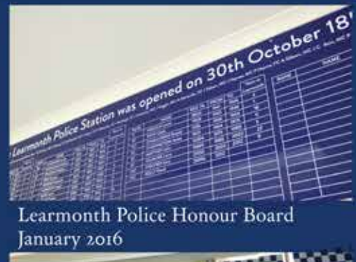
Learmonth Police Honour Board January 2016