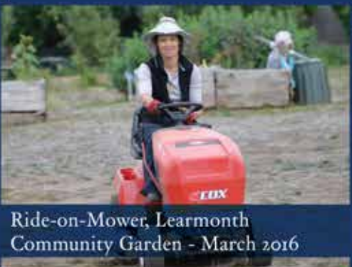
Ride-on-Mower, Learmonth Community Garden - March 2016